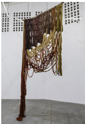
Sororidad , Angélica Serech, Fil de coton et branche naturelle, 400 × 190 cm, 2023. La Galería Rebelde.