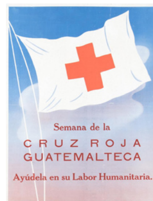
Anonyme, Semaine de la Croix-Rouge Guatemalteque, 1950