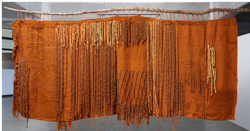
Mi historia en nudos al dorso de mi güipil , Angélica Serech, ceinture tissée et brodée, fil, cheveux et branche d'eucalyptus, 200 × 400 cm, 2021. Fundación Paiz para la Educación y la Cultura.